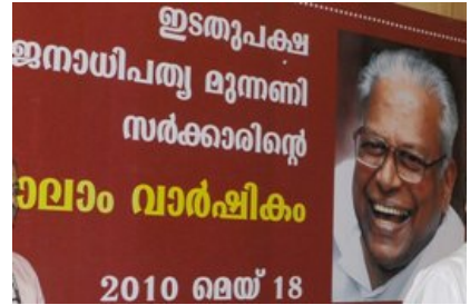
Four years of LDF Government: IT in Kerala (A Special Feature)

Click here to know more about IIITM-K Admissions